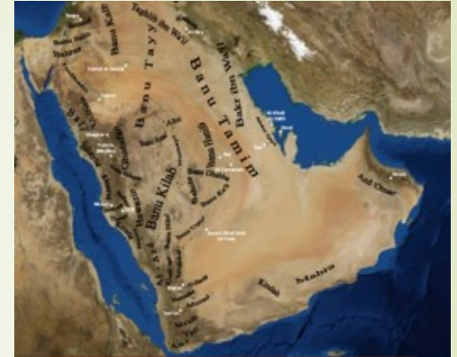
The tribes of Arabia at the time of the spread of Islam

“It is a large peninsula situated in the south-west of Asia, with an area of three million square kilometers”